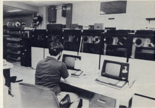
Multics equipment, worth $12 million, at the University of Calgary has been updated since 1979.